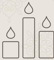
Candles around room