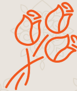
Centrepieces with roses design with mirror and tea lights