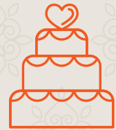
Red velvet vegan wedding cake