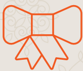
Chair covers and bands