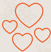
Intimate ceremony on Pool Deck