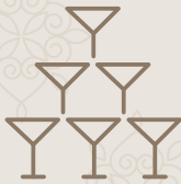
Small reception of 30 guests