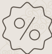
Discounted ceremony upgrade available