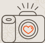
Social media promotion with Facebook photo station