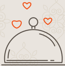
Traditional British menu