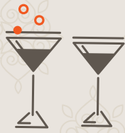
Prestige beverage package with cocktails