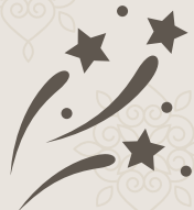
Indoor firework wall