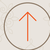
Beverage package upgrade available