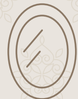
Mirror and tea lights