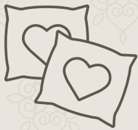
White tiffany style chairs with pink cushions or choice of accessories