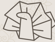
Table linen and napkins