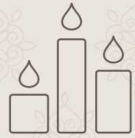
Mirror and tea lights