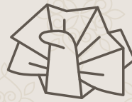
Table linen including table cloths and napkins