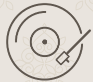
DJ and dance floor lighting