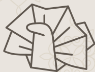
Linen and napkins