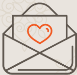
Customised table names